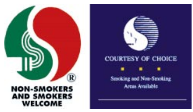
Figure 2 Logos for the original Philip Morris Accommodation Program and the IHA's Courtesy of Choice Program.

Program as a public relations campaign aimed at increasing the social acceptability of smoking than simply confusing implementation of the Pittsburgh ordinance. 59 77 78 Before the launch of the Accommodation Program, PM arranged for one-on-one meetings and presentations to obtain the support of potential allies, and recruited parties who were interested in participating in the campaign, such as restaurants, hotels, and taxi firms.78 The programme featured advertisements on 50 billboards and print advertisements in almost all local publications promoting the idea of accommodation as well as specific businesses that agreed to cooperate. PM was able to recruit about 100 restaurants to participate in the programme at a total cost of $2-4 million.75 The fact that the Accommodation Program's messages were difficult to criticise became a hallmark of the accommodation/courtesy strategy; according to Guy Smith, PM's vice president of corporate affairs: